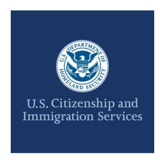
Updated U.S. Employment Eligibility Verification Form

The U.S. Citizenship and Immigration Services (USCIS) released on January 31, 2020, a new version of Form I-9, Employment Eligibility Verification.