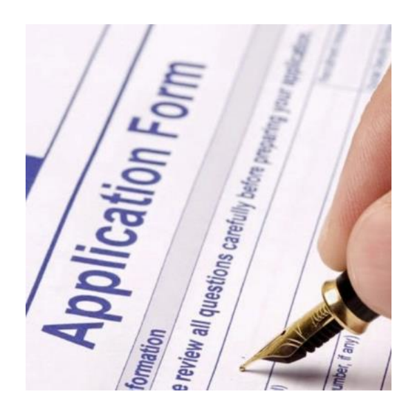
AccessNI: Newsletter 32

Our Business Improvement team have handpicked the top stories from this month's AccessNI newsletter.