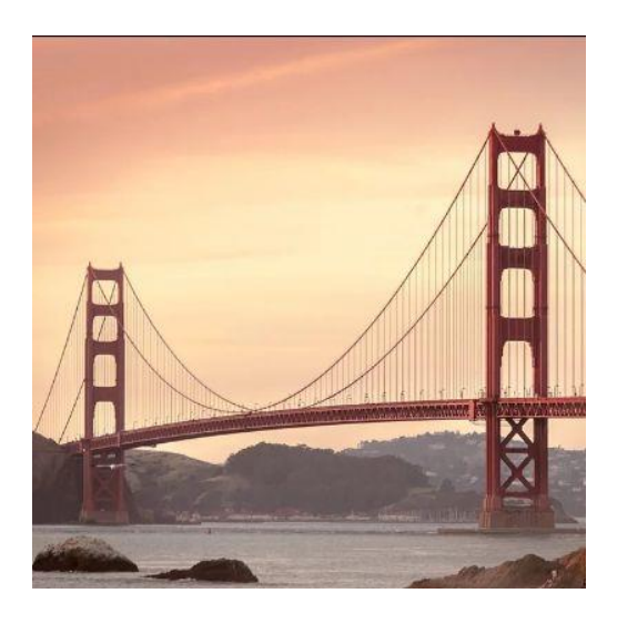
'A major, major initiative': California wants to create its own Consumer Financial Protection Bureau

Frustrated with federal inaction, California aims to build a "mini" version of a federal agency that is tasked with consumer protection.